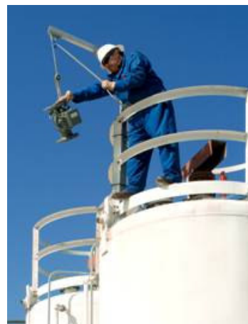
Right: Workers install emissions control equipment at an industrial facility to reduce escaping gas and improve plant efficiency.

Getting hired into a green job can pave the way for a successful career. Through apprenticeship and job placement programs, entry level workers can begin by assisting an engineer or repairman while gaining hands-on experience and working towards certification and journey-level status within a few years. This is an opportunity for someone who hasn't attended college to make more than $30 an hour in a secure field. Opportunities expand from there.