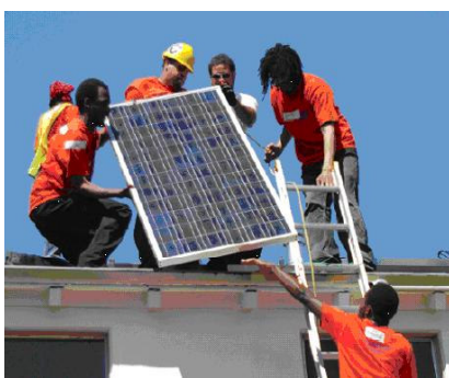
Richmond BUILD program graduates install solar panels on the home of a low-income Richmond resident. Along with its solar partners, Solar Living Institute, Solar Richmond and GridAlternatives, RichmondBUILD prepares trainees to be tomorrow's green-collar workers in the solar industry. Richmond BUILD also prepares their students for the construction industry as well.